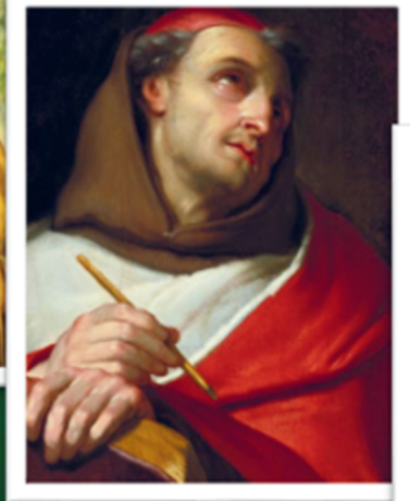
St. Bonaventure Bishop & Doctor of the Church, July 15 1221 - 1274