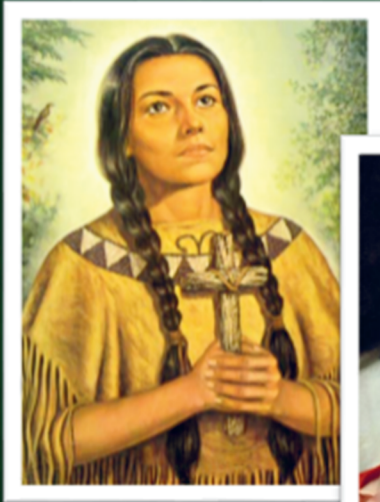
St. Kateri Tekakwitha, July 14 1656 - 1680